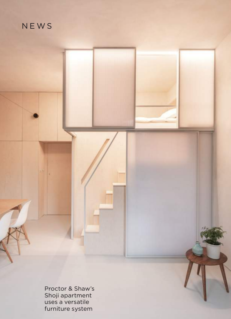
Proctor & Shaw's Shoji apartment uses a versatile furniture system