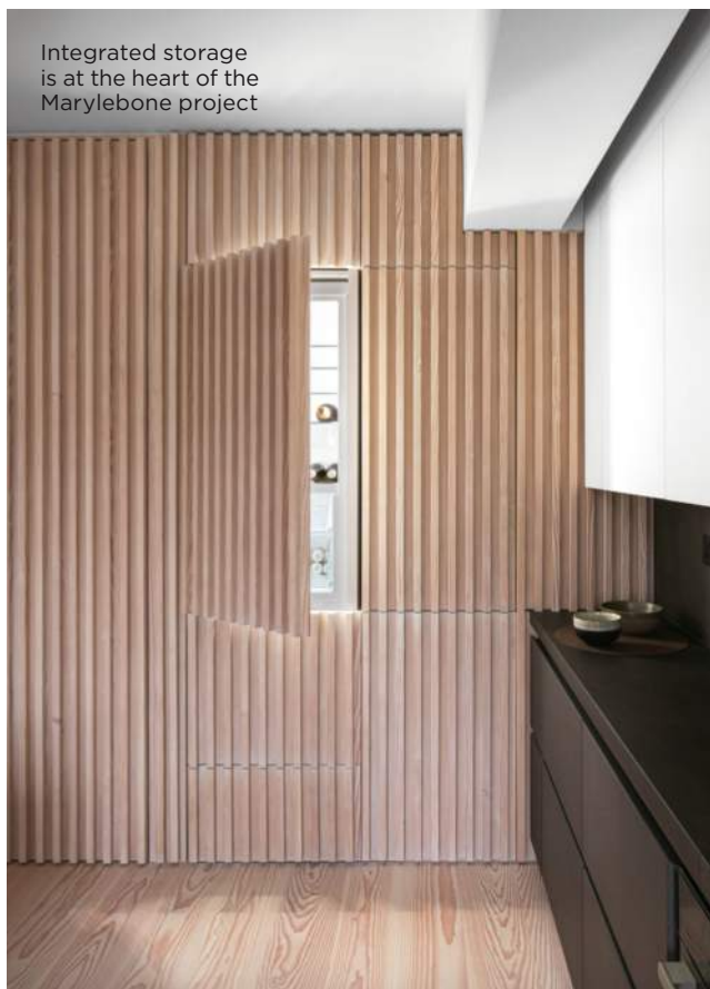
Integrated storage is at the heart of the Marylebone project